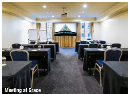
Meeting at Grace