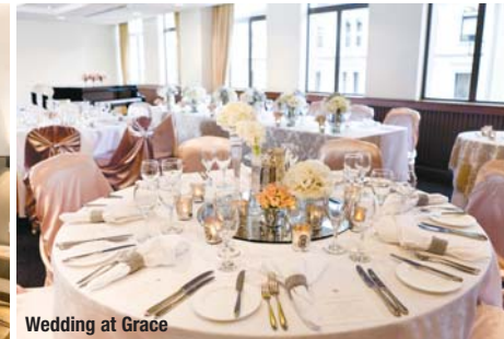
Wedding at Grace