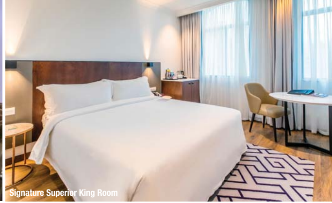
Signature Superior King Room