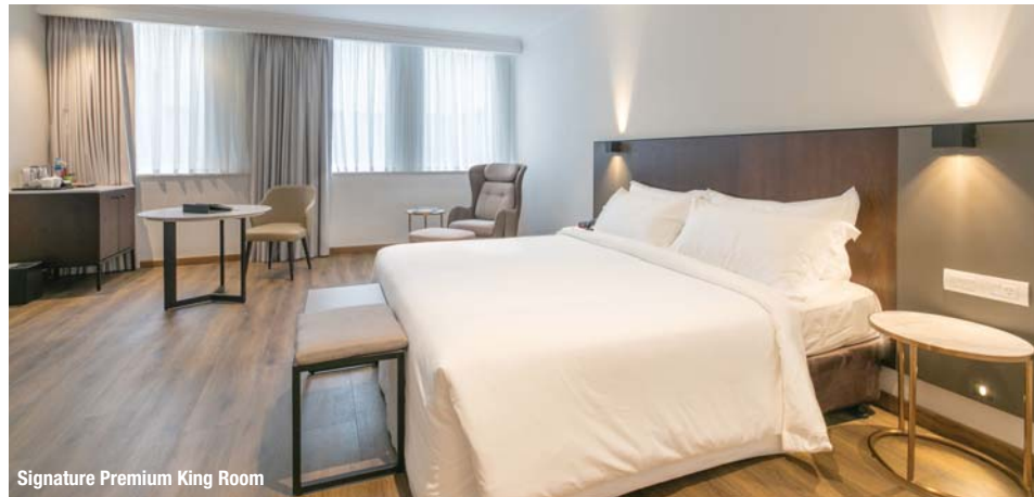
Signature Premium King Room