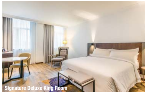
Signature Deluxe King Room