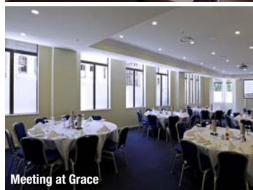
Meeting at Grace