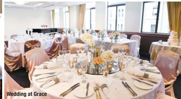
Wedding at Grace