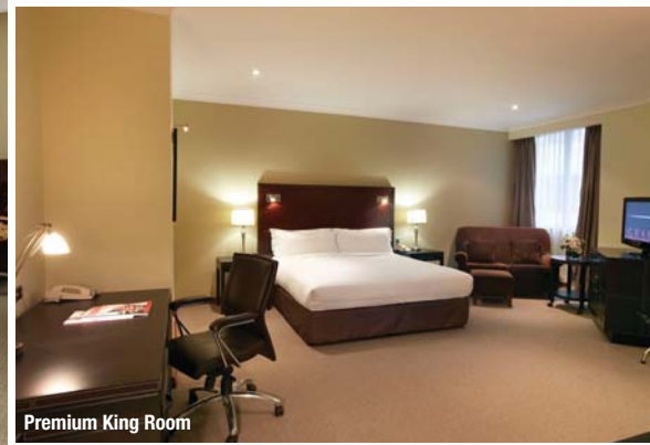
Premium King Room