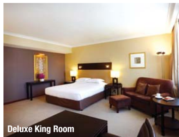
Deluxe King Room