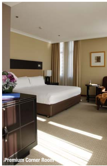
Premium Corner Room