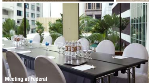
Meeting at Federal