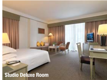
Studio Deluxe Room