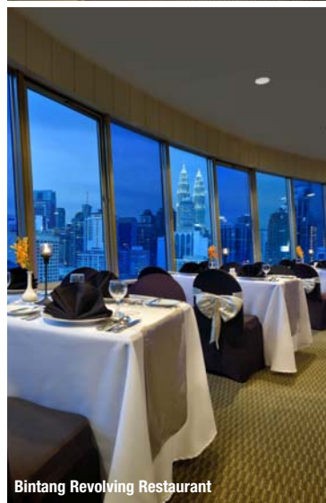
Bintang Revolving Restaurant